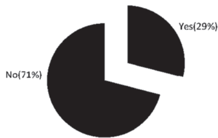
Fig.3. Knowledge about availability of CAC service at NMCTH

stated they did not and 8.3% were unsure. On detailed analysis of each respondent's knowledge regarding the situations where abortion is legalized only 11.2% had an accurate knowledge.